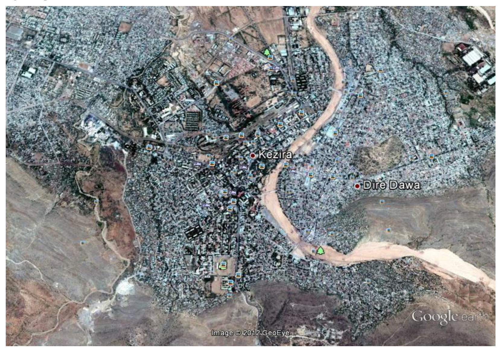
Fig. 1 Map of Dire Dawa (November 18, 2010)

"Lack of formal access and a huge demand for housing has made informal settlements a main growth area in the city. An estimated 182 000 people live in sub-standard housing, of which at least half lives in simple mud-houses or shacks. Many of these are located in hills and flood-plains, rendering a significant proportion of the inhabitants vulnerable to natural hazards such as landslides and floods..... There are at least 15 000 dwellers living in high-risk flooding areas. There are also an additional 160 000 [people] living in slums, or sub-standard housing.....These problems coupled with the lack of sufficient flood drainage system are posing a health and sanitation threat to the city. "