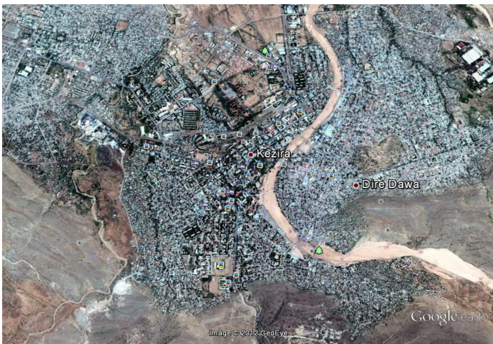
Fig. 1 Map of Dire Dawa (November 18, 2010)

“Lack of formal access and a huge demand for housing has made informal settlements a main growth area in the city. An estimated 182 000 people live in sub-standard housing, of which at least half lives in simple mud-houses or shacks. Many of these are located in hills and flood-plains, rendering a significant proportion of the inhabitants vulnerable to natural hazards such as landslides and floods..... There are at least 15 000 dwellers living in high-risk flooding areas. There are also an additional 160 000 [people] living in slums, or sub-standard housing.....These problems coupled with the lack of sufficient flood drainage system are posing a health and sanitation threat to the city. ”